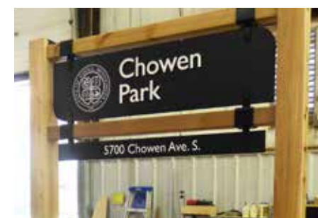
New park signs will be more visible, improve aesthetics and make it easier to locate parks.

For more information, contact the Parks & Recreation Department at 952-826-0367.