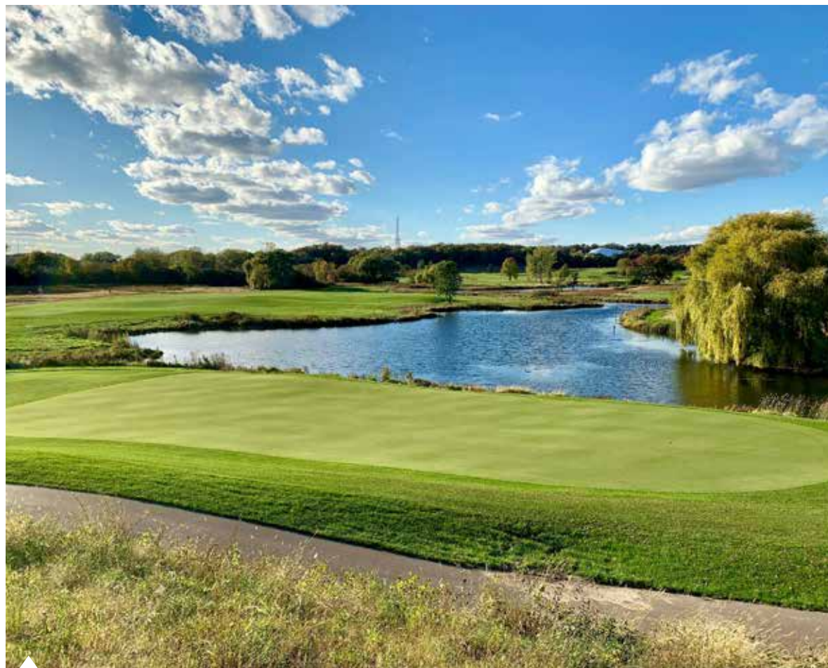
The new Championship 18 combines a picturesque golf course with natural areas, including wetlands and restored oak savannah.

"It's so beautifully built for every type of player," said Erck, who has been involved with Braemar Golf Course in a variety of ways since it opened in 1964.