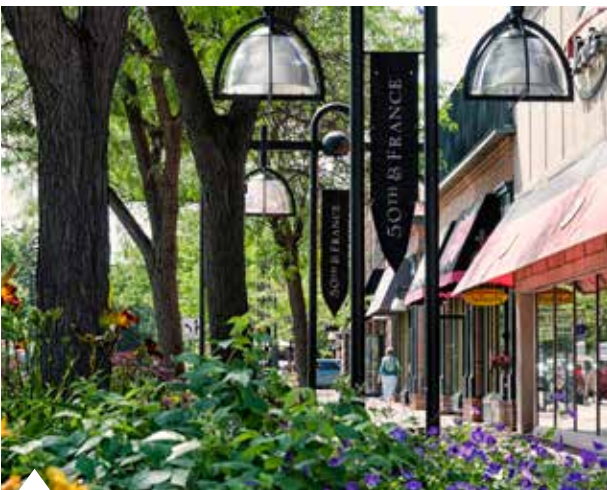
The City Council authorized a small area plan for the 50th & France district.

The City Council will next meet 7 p.m. May 7 and 21 in the Council Chambers of Edina City Hall, 4801 W. 50th St. For more information, visit EdinaMN.gov .