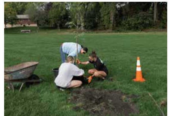
The City plans to hold more volunteer tree-planting events like this October one that added 75 trees to Fred Richards Park.

“We will plant a diverse mix of species to increase our tree diversity in the city,” he said. This creates visual variety and keeps a single pest or disease, such as emerald ash borer, from wiping out a significant portion of the canopy.