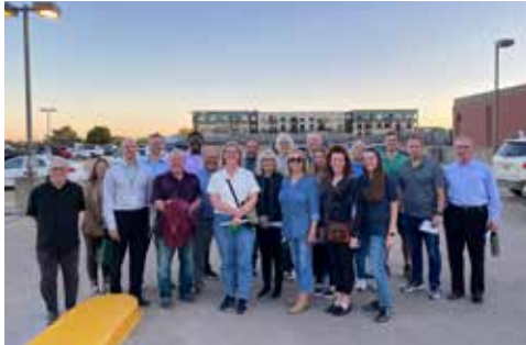
Get involved in a Board or Commission! Above, City Council and Board and Commission members get an infrastructure tour with Engineering and Public Works. (File Photo)

Applications Accepted Through Jan. 14 for Arts, Energy, Health and More