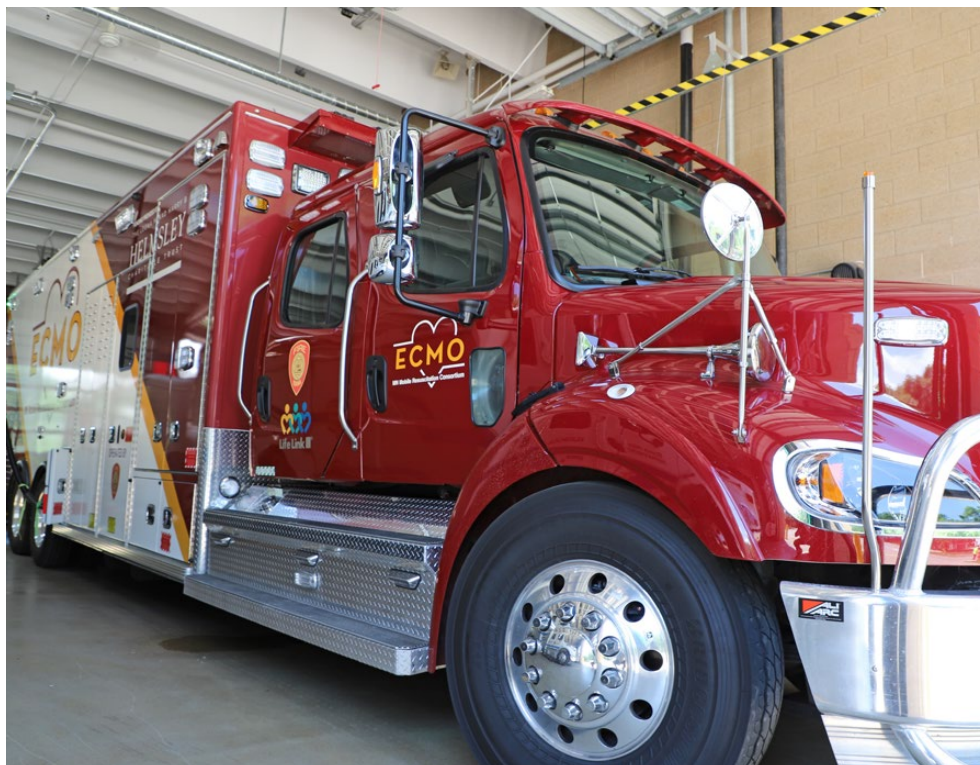
Housed at Fire Station 1, the ECMO truck will be driven by Edina paramedics who will also assist during the procedures.

ECMO specialist physicians serve on-call and are dispatched to the site of the truck when needed, handling the procedure