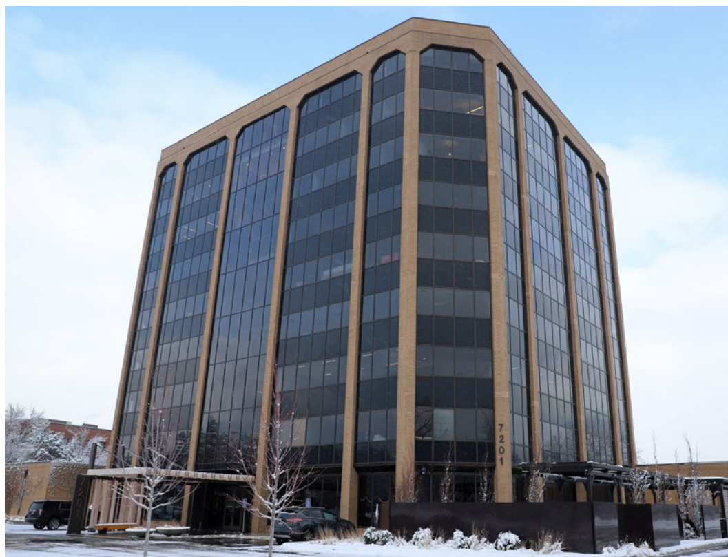
The Edina Innovation Lab will take over empty office space on part of the fifth floor of The E, the former Regis Corp. headquarters building.

The loan helps launch the lab, but doesn't commit the City to operational costs or added staffing. Instead, the terms are