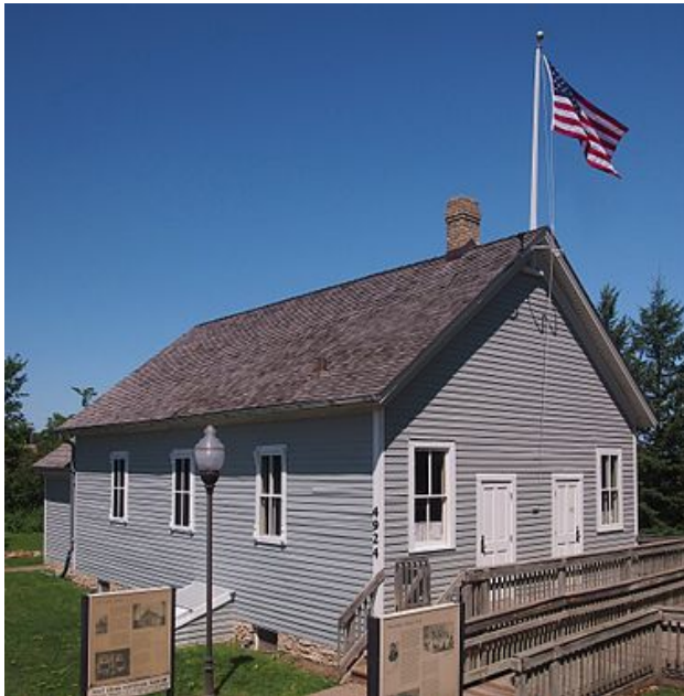
Historic Cahill School was built in 1864 and was located near the intersection of 70th and Cahill. It served as the center of Edina’s Irish community, providing a gathering place for school, meetings, church services, and social events. It was used by the congregation of St. Patrick’s Catholic Church until 1958. It is on the National Register of Historic Places.

The purpose of this Comprehensive Plan chapter is to help decision-makers plan for the wise use of heritage resources. The Heritage Preservation Chapter also helps improve city officials’ understanding and awareness of the role heritage preservation plays in the delivery of important municipal services. Equally important is the comprehensive nature of this chapter, which, in scope, is integrated with other city planning efforts and provides an efficient and effective means of evaluating the performance of the heritage preservation program.