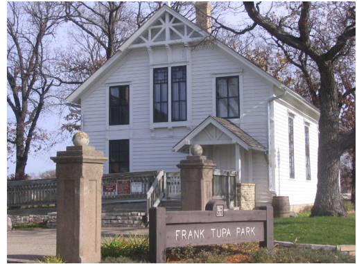
Frank Tupa Park is located in northeast Edina on Eden Avenue, directly across from Edina City Hall. This one-acre park is the home of the Old Cahill School, visited throughout the year by students who want to experience a day of school in the 1800s.

A number of new historic contexts are currently being developed for the identification and evaluation of specific types of historic resources, such as churches, Cold War fallout shelters, American Foursquare style houses, and the Works Progress Administration.