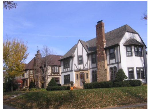
A Heritage Preservation Landmark overlay zoning designation was assigned to the Country Club District in 2003.