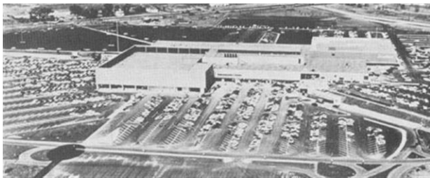
Southdale Center, Designed by Victor Gruen Associates, opened in 1956 and is the oldest fully enclosed, climate-controlled shopping mall in the United States.

The heritage resource identification and evaluation effort is ongoing, and as of 2018, it is estimated that approximately 75 percent of the city remains un-surveyed for heritage resources.