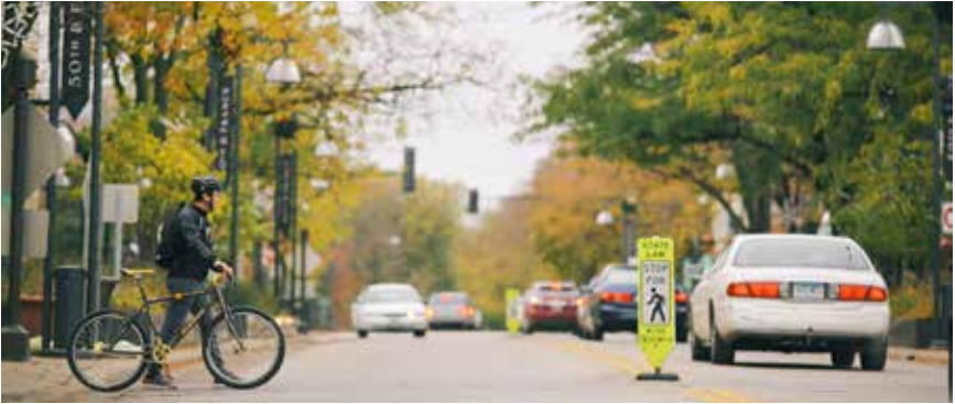
50th & France