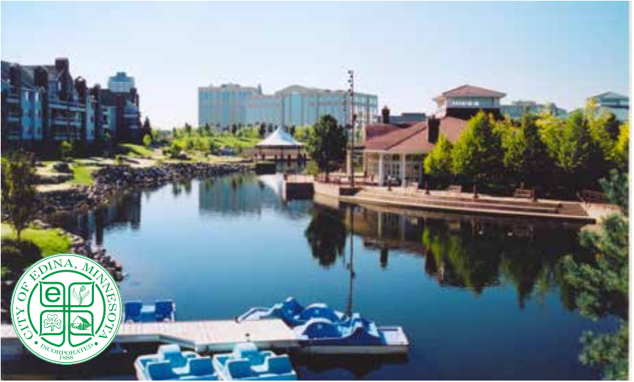
Centennial Lakes Park