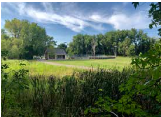
Walnut Ridge Park

municipal assets. We urge Congress to analyze the FCC rulings and recognize that the siting of wireless facilities on city assets must balance the needs of the wireless companies with the ability of cities to make decisions that are best for their communities.